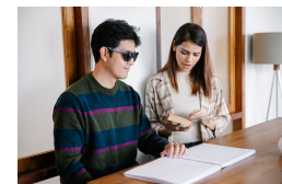
Literacy and Reading