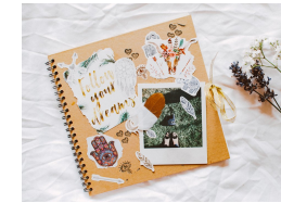
Literacy and Scrapbooking