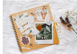
Literacy and Scrapbooking